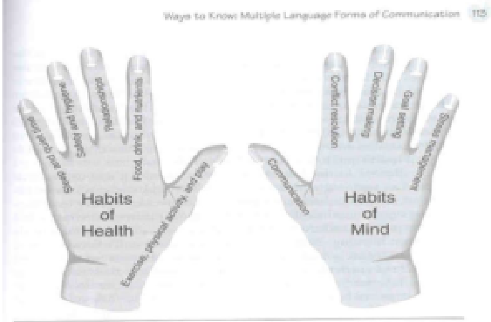
Figure 4.1 Habits of health and habits of mind.

A key model that organizes personal and professional development in the undergraduate Public Health Education course is called Habits of Health and Habits of Mind (Ubbes, 2008, p. 113). As shown below, the Habits of Health model (left hand) outlines the health behaviors to be practiced every day. The Habits of Mind model (right hand) shows the cognitive skills that lead to the doing of the health behavior. For example, the cognitive skills of communication and conflict resolution are practiced daily when building the health behavior of relationships. Health educators, medical and dental professionals, and therapists can all benefit from early and ongoing training in communication and conflict resolution skill development leading to effective interpersonal relationships with their learners, participants, and clients. This model uses a developmental perspective across the lifespan to help people practice daily habits and routines for health. When the Habits of Health and the Habits of Mind are integrated and combined on a daily basis, it forms the whole curriculum for the whole person.